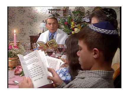
"...And you shall tell your son..."